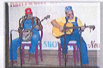
THE MORON BROTHERS (FRI)