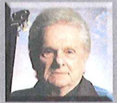
DR. RALPH STANLEY & HIS CLINCH MOUNTAIN BOYS (FRI)