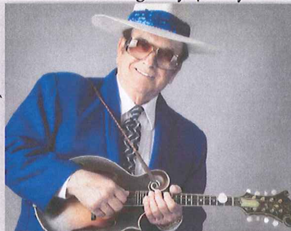
BOBBY OSBORNE & THE ROCKY TOP X-PRESS