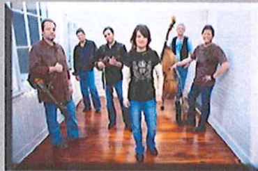
THE GRASCALS (SAT)