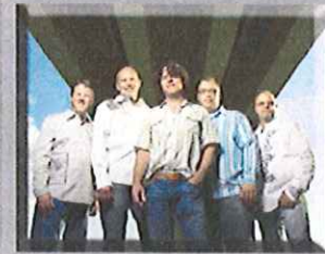
LONESOME RIVER BAND (SAT)